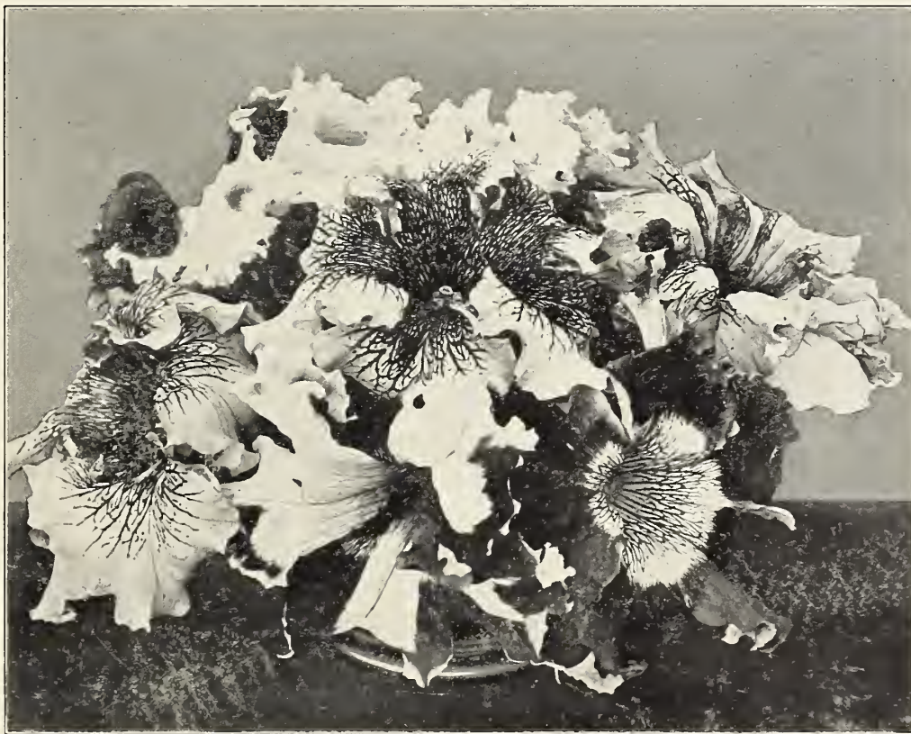
PETUNIA—GIANTS OF CALIFORNIA

TERMS: F. O. B. California terminal; flower and vegetable seeds, 60 days net or 2 per cent discount for cash within 30 days from date of invoice.